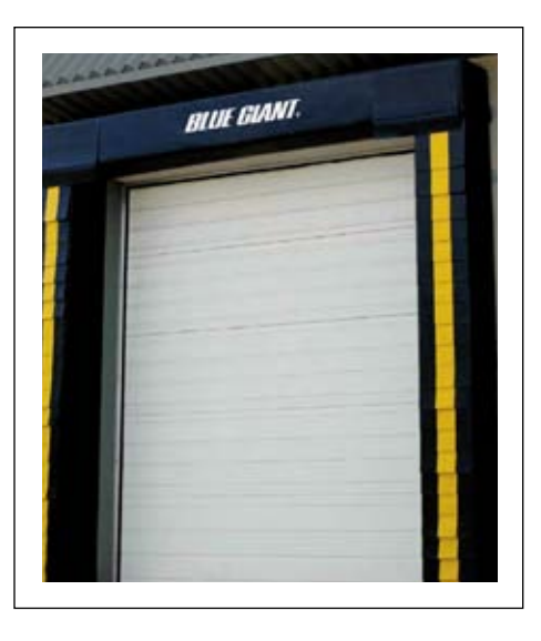
BGDSF Fixed Head Pad Dock Seal